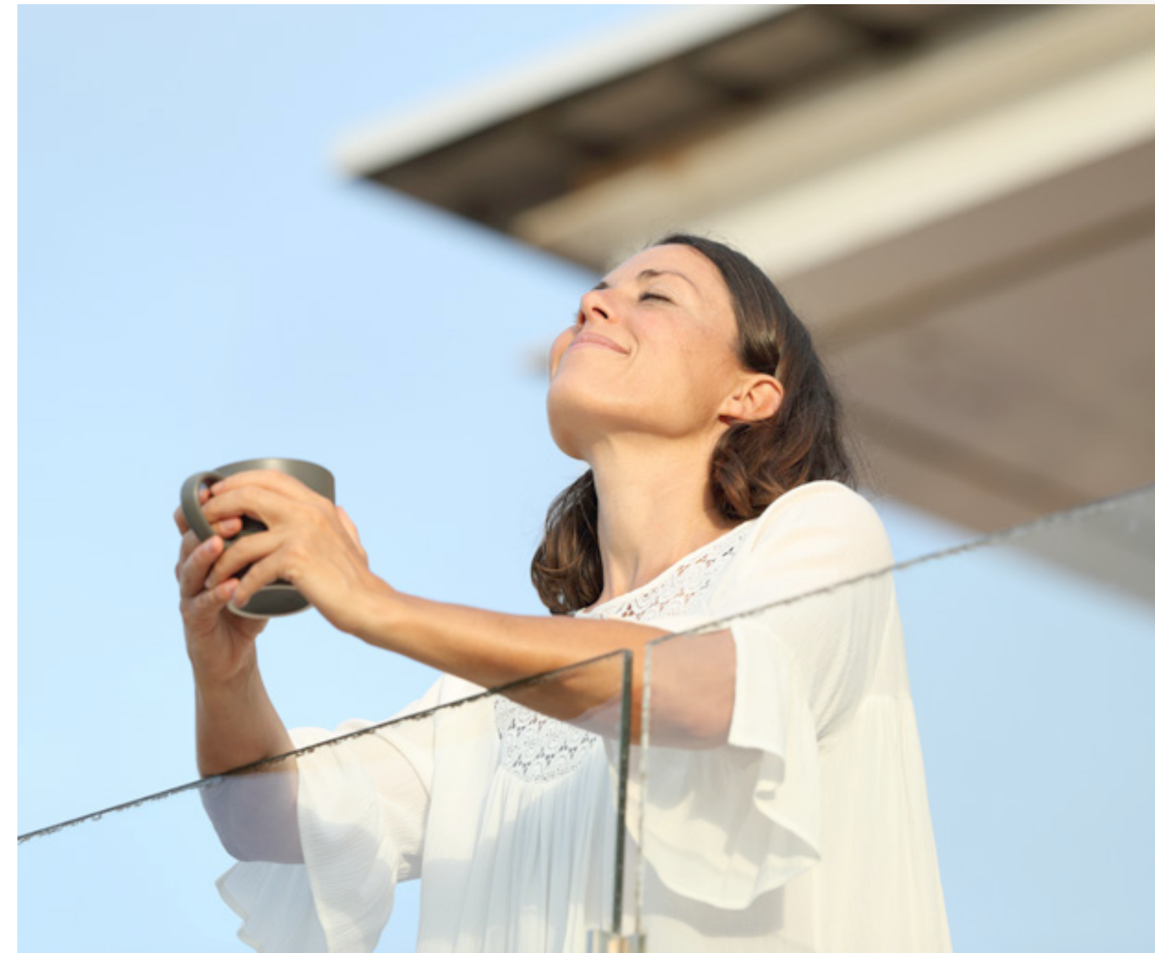
Sun shading elements (balconies & perforated panels)

Extensive landscaping with native plants or adaptable species enhances the property's beauty and value while reducing its environmental impact. Other environmentally friendly features include advanced waste management and water reuse solutions, as well as a bicycle storage area and EV parking to encourage residents to use less traditional combustion engines.